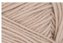
3021 Lys beige