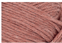
3543 Varm brunmelert