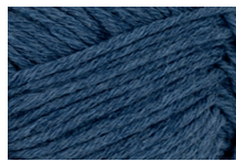
5864 Blå melert