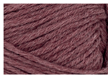
4344 Mørk pudderrosa