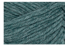
6862 Dyp aqua