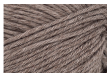
2652 Mørk beigemelert