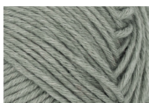
8521 Støvet lys grønn