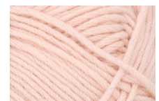
3509 / Ny Ballet tutu