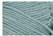
6841 Støvet aqua