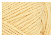
2112 / Ny Lys gul