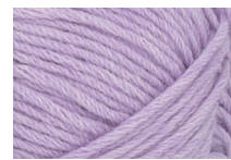
5023 / Ny Lilac