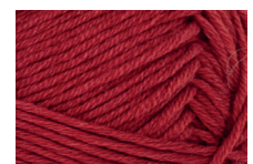
4236 Dyp rød