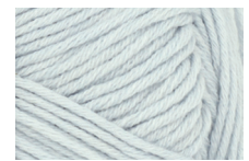
5811 / Ny Arctic ice