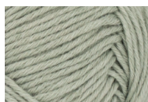
9541 Grønn te