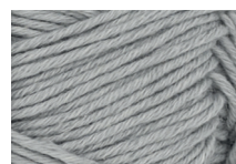
6030 Lys grå