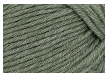
9551 Støvet mosegrønn